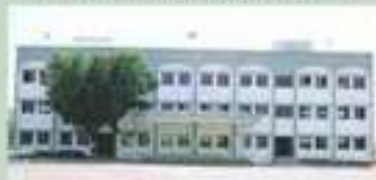
Yavatmal Public School, Yavatmal