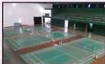
Indoor Stadium: [37Mtrs x 40 Mtrs.]