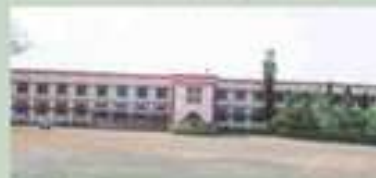
Amolachand Mahavidyalaya, Yavatmal