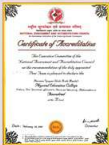
Accredited by MAAC with 'B' Grade 2005-2010