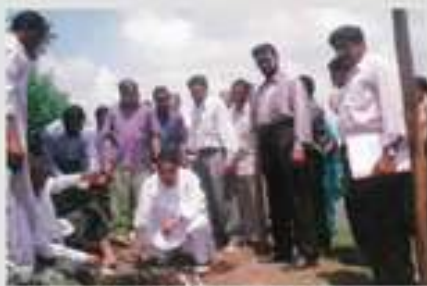
Tree Plantation in College Campus