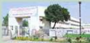
Anglo Hindi Junior College, Yavatmal