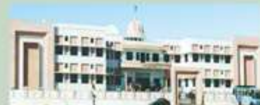
Swatantra Senani Jawaharlal Darda College of Law