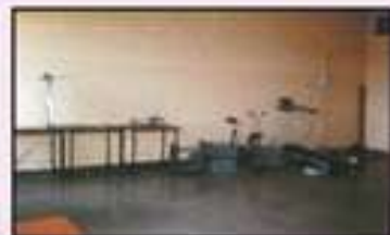
Sports Psychology Lab.