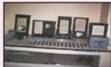
Human Performance, Sports - Biomechanics, Measurement and Sports Training Lab.

Education Technology Lab. Research Center