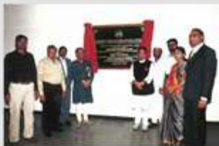
Inauguration of Indoor Stadium