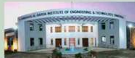
Jawaharlal Darda Institute of Engineering & Technology, Yavatmal