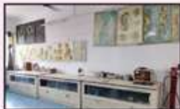
Athletic care and rehabilitation exercise Physiology, Anatomy, Physiology & Health Education Lab.