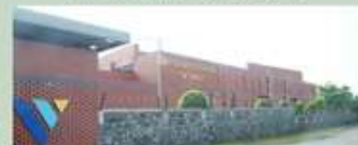
Venadevi Darda English Medium School

Hon'ble Shri. Vijay Darda through his vision and dedication, with support of his brothers and Qualified professionals has pioneered the growth of the