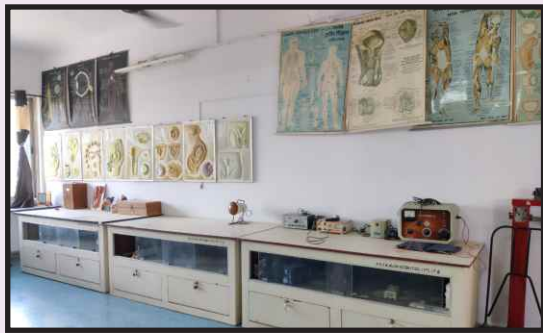
Athletic care and rehabilitation exercise Physiology, Anatomy, Physiology & Health Education Lab.

Education Technology Lab. Research Center