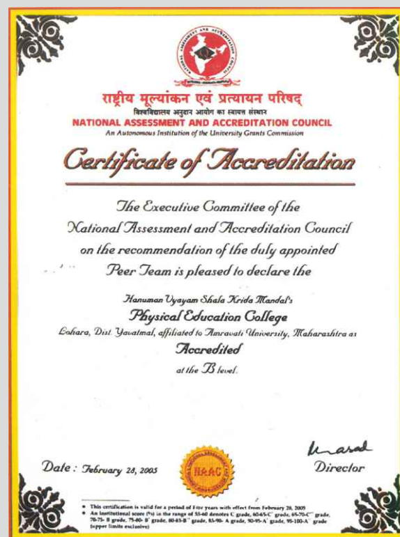
Accredited by NAAC with 'B' Grade 2005-2010