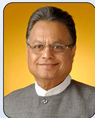
Hon'ble Shri Dr. Vijay Darda Chairman, Lokmat Group of Newspaper M.P. (Rajya Sabha 1998-2016) President, H.V.S.K.M. Yavatmal