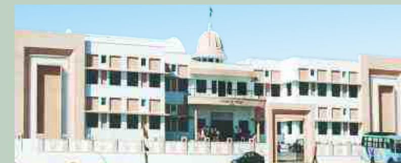
Swatantra Senani Jawaharlal Darda College of Law