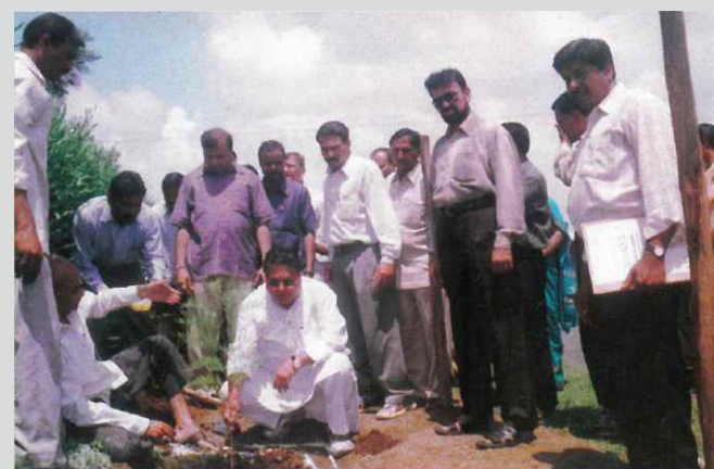
Tree Plantation in College Campus