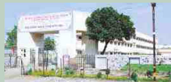
Anglo Hindi Junior College, Yavatmal