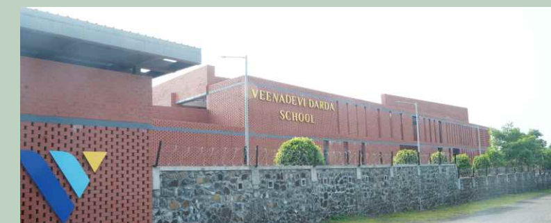
Veenadevi Darda English Medium School

Hon'ble Shri. Vijay Darda through his vision and dedication, with support of his brothers and Qualified professionals has pioneered the growth of the