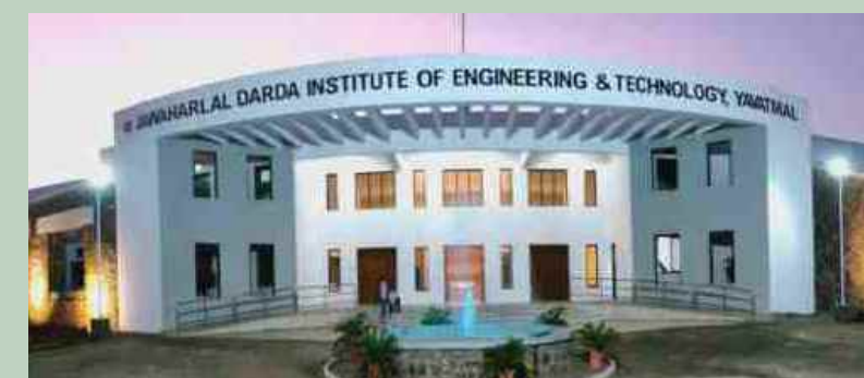
Jawaharlal Darda Institute of Engineering & Technology, Yavatmal