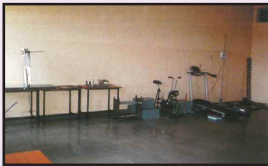
Sports Psychology Lab.