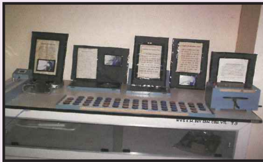
Human Performance, Sports - Biomechanics, Measurement and Sports Training Lab.