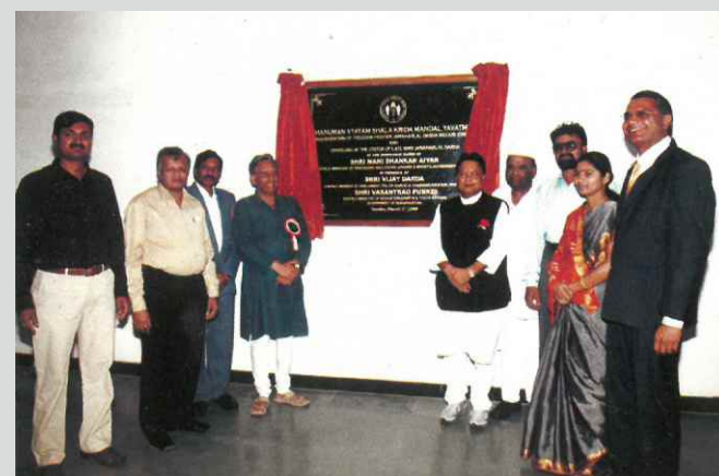
Inauguration of Indoor Stadium