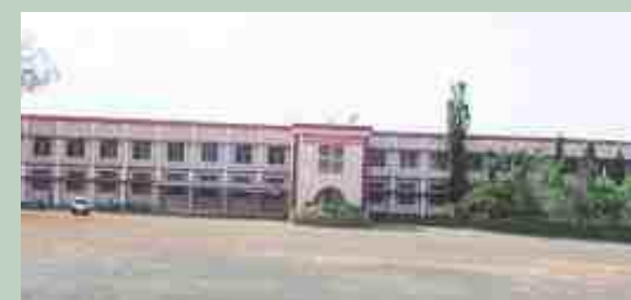
Amolakchand Mahavidyalaya, Yavatmal