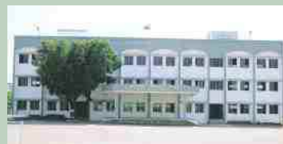
Yavatmal Public School, Yavatmal