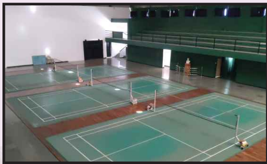
Indoor Stadium: [37Mtrs x 40 Mtrs.]